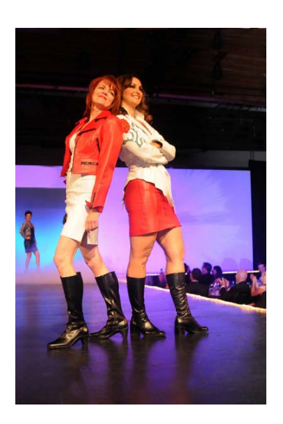
2012 Stepping Out Models make their runway debut