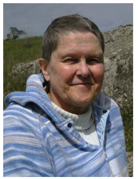
Help ensure that future patients struggling with breast cancer receive the help they need.

For years to come, your generous gift will help ensure the continuation of To Celebrate Life's mission of providing support to Bay Area women and men living with breast cancer. As an all-volunteer breast cancer organization, we put your dollars to work in our community, not in our overhead.