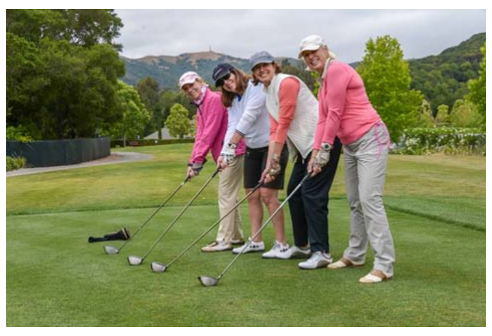
Tee It Up golfers:

Lots of fun vying for the closest to the pin, the longest drive, and especially the Hole-In-One, where the winner was hoping to go home in a brand new Mercedes SUV. Although the automobile did go back to R.A.B. Motors / Mercedes Benz, Tee It Up's Premier Presenting Sponsor, Mercedes Benz is sending two members of the winning foursome to