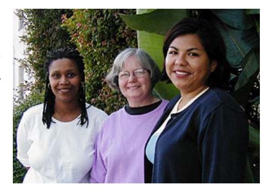
Charlotte Maxwell Complementary Clinic social workers offer supportive services.