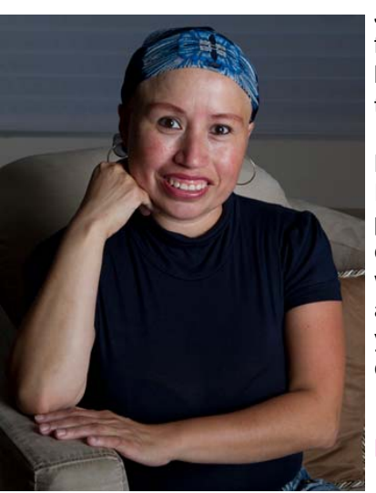
Help ensure that future patients struggling with breast cancer receive the help they need.

Join our Celebration Circle and help fulfill our vision that no one faces breast cancer alone ...now, and in the future.