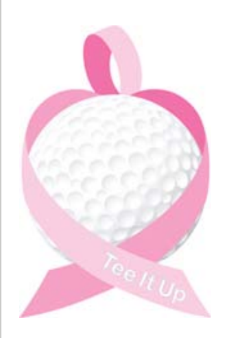
Tee It Up To Celebrate Life Monday, June 25 Marin Country Club

5:00 PM Saturday, June 16 Tamalpias High School Mill Valley Half of the proceeds from this premier soccer league game benefit To Celebrate Life