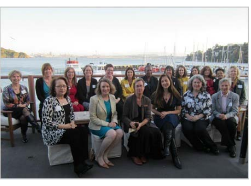
Our 2012 Grantees, representing 19 Bay Area nonprofits

The 2012 Foundation's Grants Review Committee, made up of local health leaders, community members and Foundation directors, awarded $237,000 to 19 Bay Area nonprofit organizations at an uplifting and inspirational reception held at Servino's in Tiburon on April 4th.