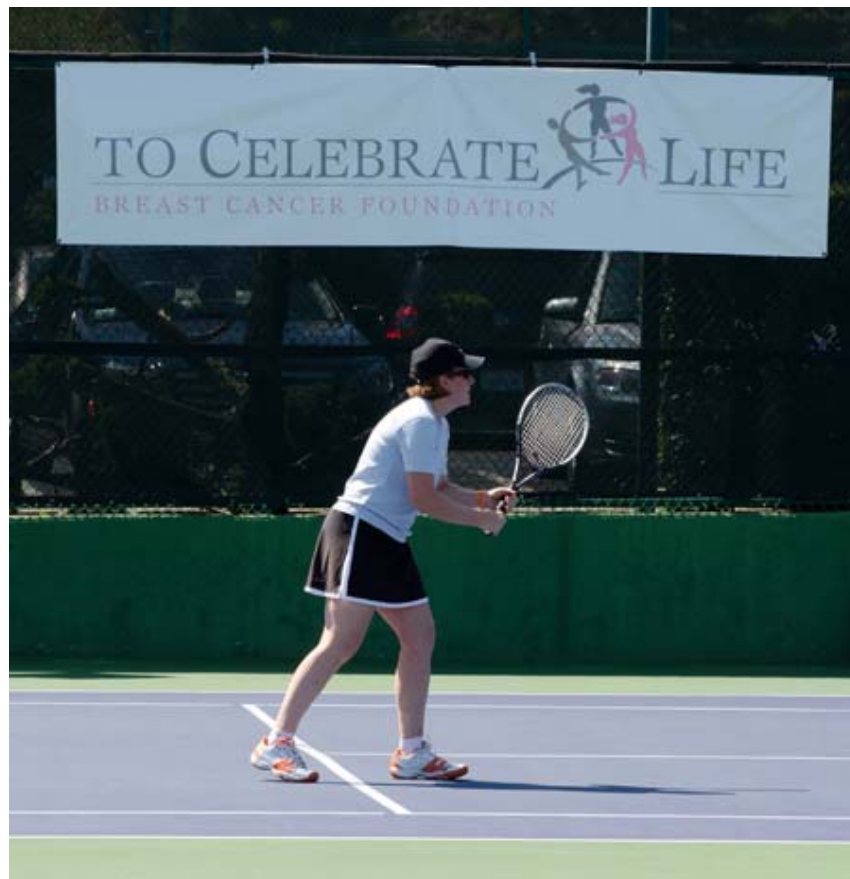
Rally for Health and Hope Harbor Point, Mill Valley