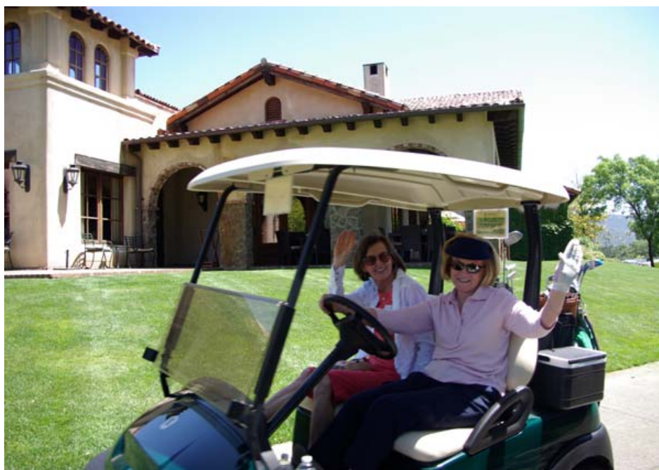
A great day of golf! Tee It Up To Celebrate Life , Sonoma Golf Club