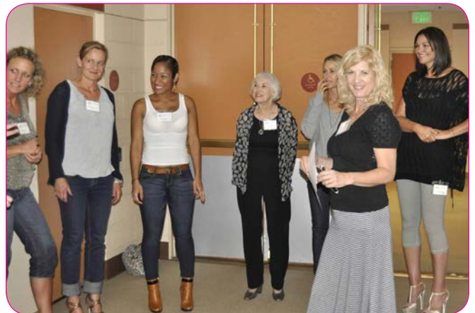
(Below) Backstage with Stepping Out models at Marin Center Exhibit Hall rehearsal. — 2012 Stepping Out To Celebrate Life

"I love the name To Celebrate Life — every day should be a celebration in some way."