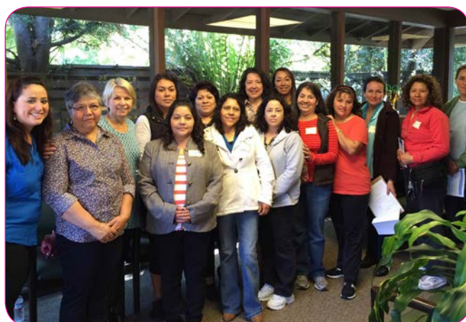
Healdsburg Breast Education Class – Spring 2014.

Words written by Sutter Pacific Navigation Program patients describing how program support services have helped them.