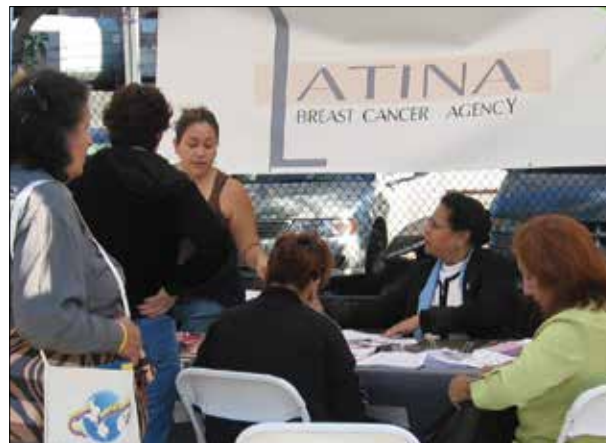
Latinina Breast Cancer Agency Health Fair