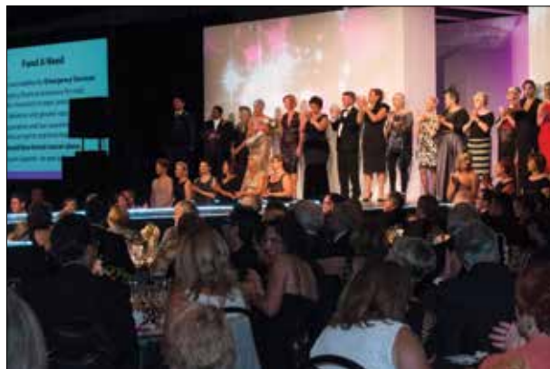
Guests raised their paddles for Fund A Need which provides emergency and direct services through the Foundation's Grants Program. — 2016 Stepping Out Gala

Continuous reporting and mid-year site visits by the Foundation's Board of Directors ensure grant funds are being used appropriately. With our careful selection process and meticulous follow up, you can be certain that your contributions are going where you intended — to help people with critical needs, throughout the communities we serve.