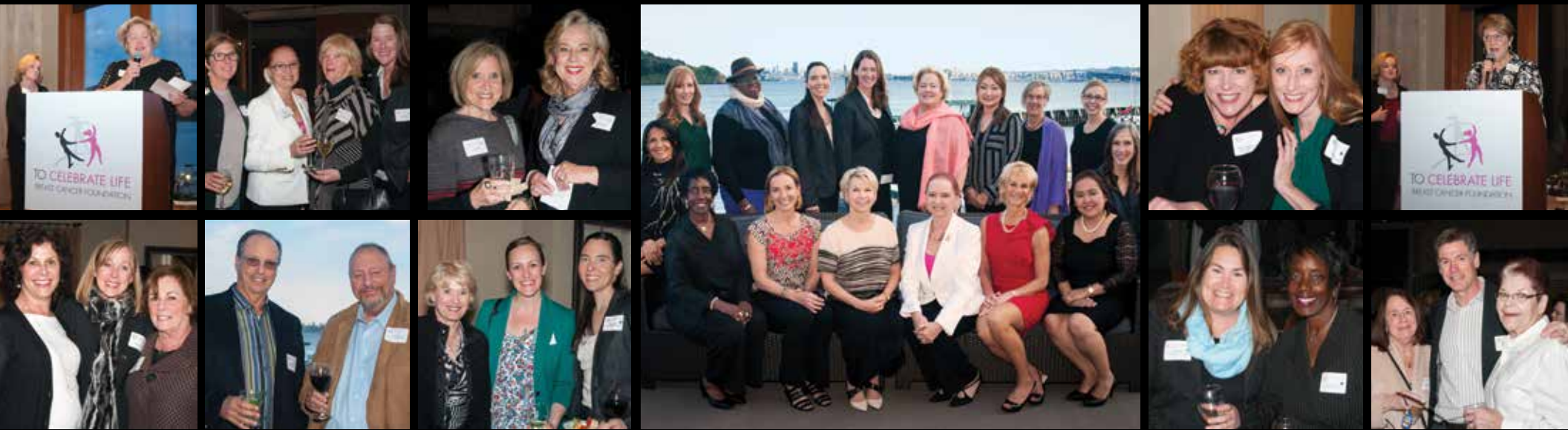
Grants Reception — March 28, 2016

We Celebrate Life — We are guided by our survivor spirit and our passion to touch the hearts of those who need our help