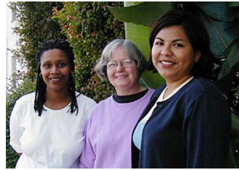
Charlotte Maxwell Complementary Clinic social workers offer supportive services.

advocacy and navigation along with complementary alternative medicine proven to reduce the side effects of chemotherapy and radiation. This protocol effectively addresses the basic and physical needs of women battling breast cancer and poverty.