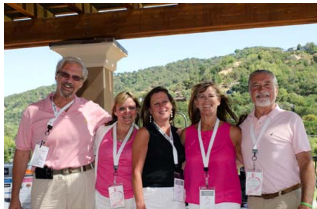
Tee It Up volunteers help create a successful silent auction.