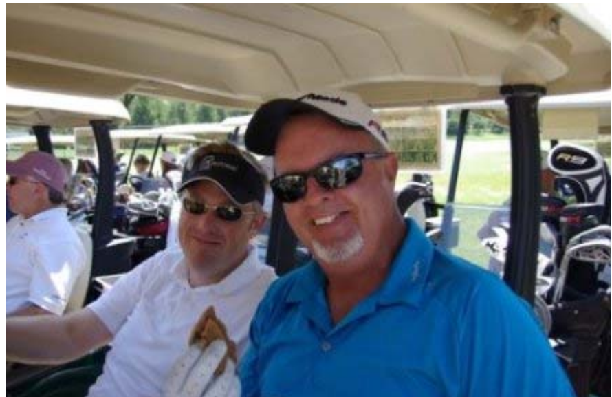
Let the games begin!