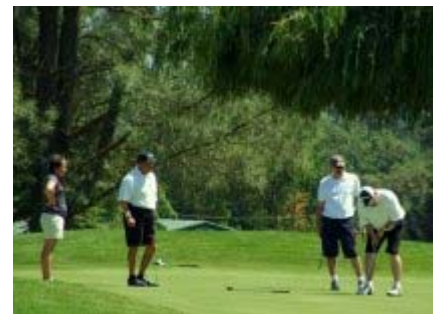
Golfers enjoy a perfect day at the beautiful Sonoma Golf Club.